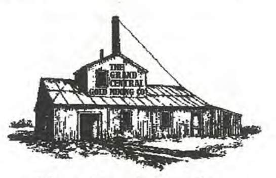
Editor: Bonnie Breedlove Copyright 2006 by the Granville County Genealogical Society 1746, Inc.