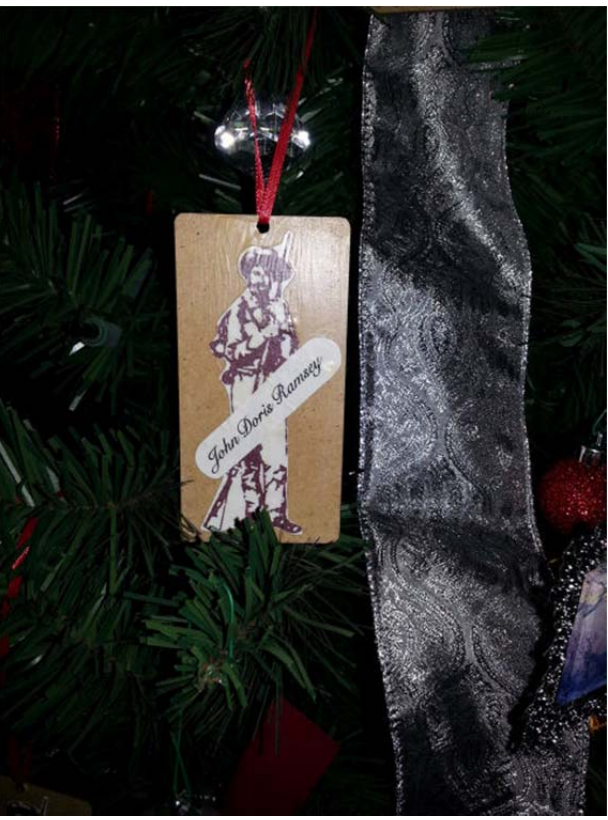
Confederate Tree Ornament