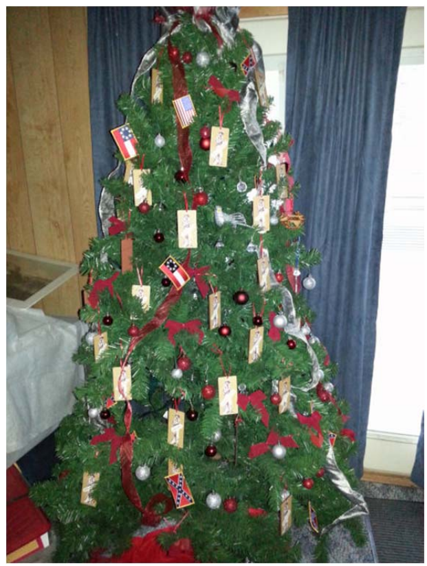
Confederate Christmas Tree