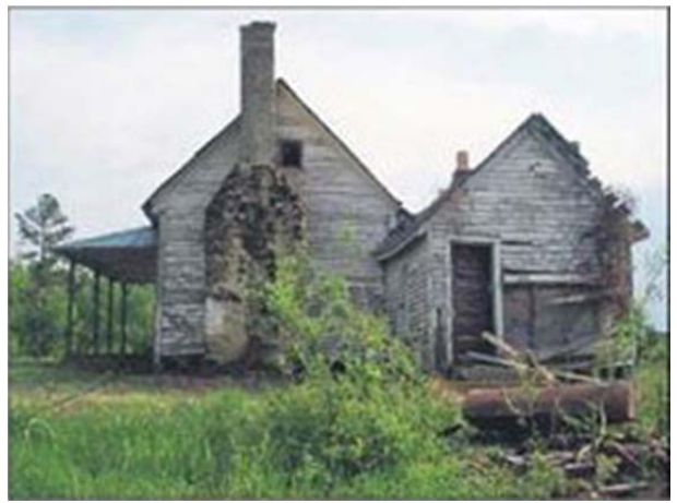
Barker House constructed around 1763